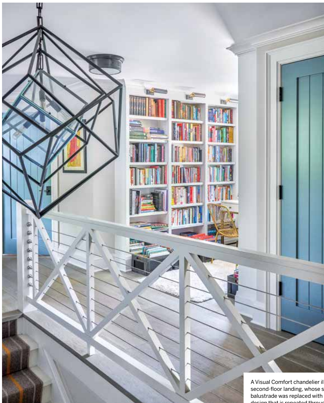
A Visual Comfort chandelier illuminates the second-floor landing, whose stodgy colonial balustrade was replaced with a bolder X design that is repeated throughout the home. Doors are all painted the same shade of blue as the kitchen cabinetry to help unify the interior. FACING PAGE: Daughters Kalvyn and Jade stroll past the pool their parents added. The chaise lounges and chairs are from Lillian August.

Moving a staircase opened up the kitchen, which was still hampered by a pair of pesky support columns. Sanders integrated the posts into a floating L-shaped cabinet; the adjacent table, flanked by two benches, is the home's sole dining area. "This was one of the best decisions we made," says Kaitlyn, who rarely used the old dining room. "We can actually squeeze about eighteen